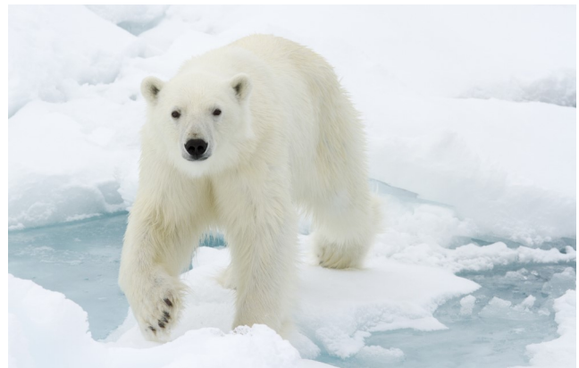
PBDE flame retardants are widespread in the environment and have been found in body fluids & tissues of wild-life, including polar bears.

Flame retardants are usually chemically stable.