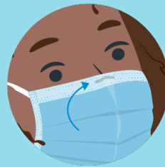
Place the metal piece or stiff edge over your nose