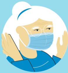
Avoid touching the mask