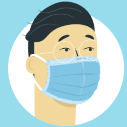
Cover your mouth, nose, and chin