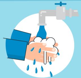
Wash your hands before touching the mask