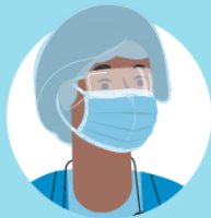
Ensure the colored-side faces outwards