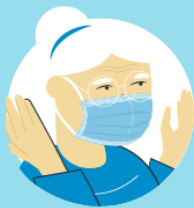
Avoid touching the mask