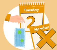
Do not re-use the mask

Remember that masks alone cannot protect you from COVID-19. Maintain at least 1 metre distance from others and wash your hands frequently and thoroughly, even while wearing a mask.