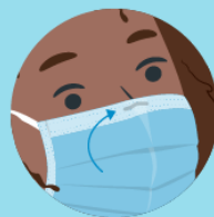
Place the metal piece or stiff edge over your nose