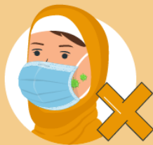
Do not wear a loose mask