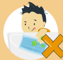
Do not leave your used mask within the reach of others