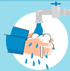
Wash your hands before touching the mask