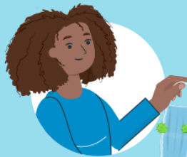
Keep the mask away from you and surfaces while removing it