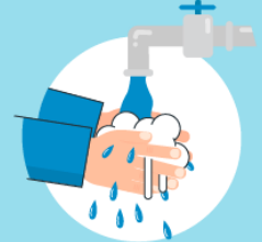
Wash your hands after discarding the mask