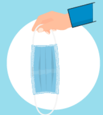
Inspect the mask for tears or holes