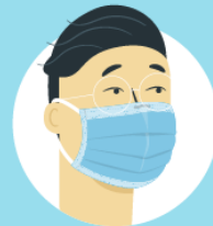
Cover your mouth, nose, and chin