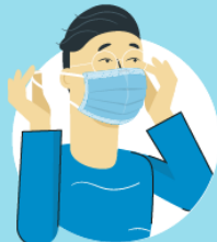
Remove the mask from behind the ears or head