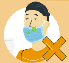
Do not wear the mask only over mouth or nose