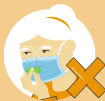
Do not touch the front of the mask