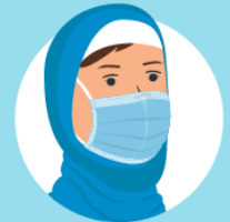
Adjust the mask to your face without leaving gaps on the sides