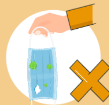
Do not use a ripped or damp mask