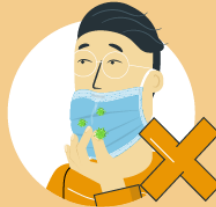
Do not remove the mask to talk to someone or do other things that would require touching the mask