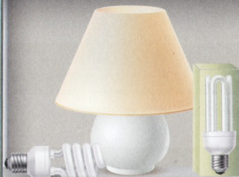
ENERGY & CLIMATE

Technology As a society we're beginning to understand the need to regulate the digital world and to think about how best to do so. But Big Tech wants to use the US-UK trade deal to keep the online world unregulated. The deal would concentrate even more power over our economy into the hands of a small number of US tech firms like Google, Amazon and Facebook.